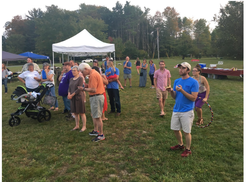
FOM hosted a Mascoma mixer in September 2017, this casual get together included lawn games and lots of