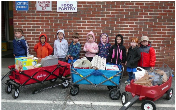
Mascoma Cooperative Preschool students with their food drive donations at the Enfield pantry.

The Canaan pantry started out in one (100 sf) room and our distribution site was housed in a construction trailer. Matt and Rebecca Dow, owners of MTD's Property Maintenance & Construction, donated additional space in the building to allow operations to expand. We are pleased to report that in July 2017, we moved into a 1,700 sf combined pantry and distribution site, thanks MTD's!