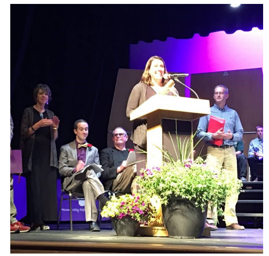
Board members presenting scholarship awards at MVRHS in June.