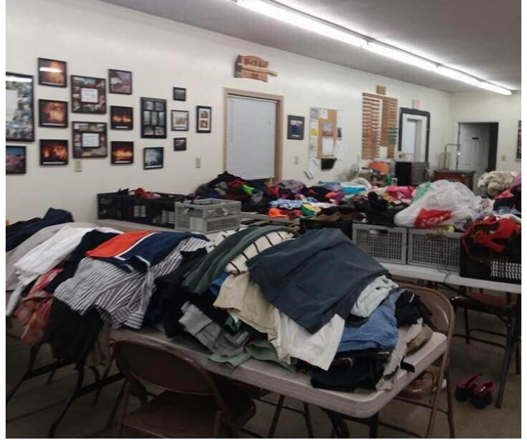
Clothing Drive at the Canaan Fire Station.