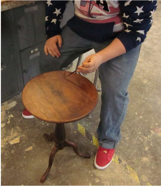
A student faux graining the table top of his candlestand table.