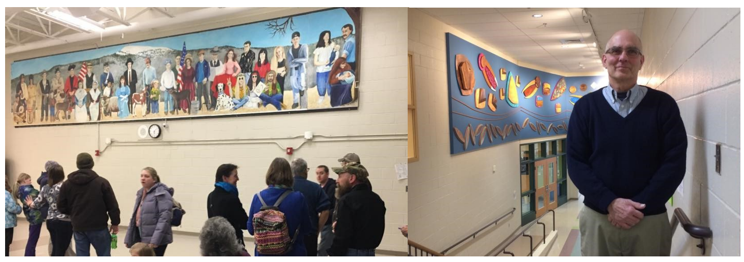
Unveiling of the Generations mural (left) and Diverse Unity (right) - both at MVRHS.

If you have not already seen the restored mural be sure to check it out on your next trip to MVRHS. Thank you to everyone that donated and volunteered their time to make this restoration project a reality.