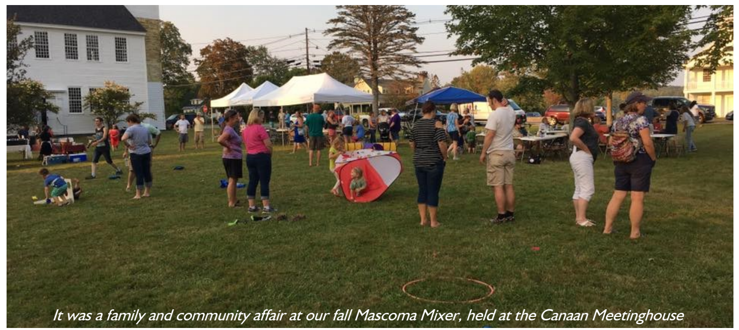
Image: Second2017 ANNUALFRIENDS OF<br/>MASCOMA2017 ANNUAL<br/>REPORT