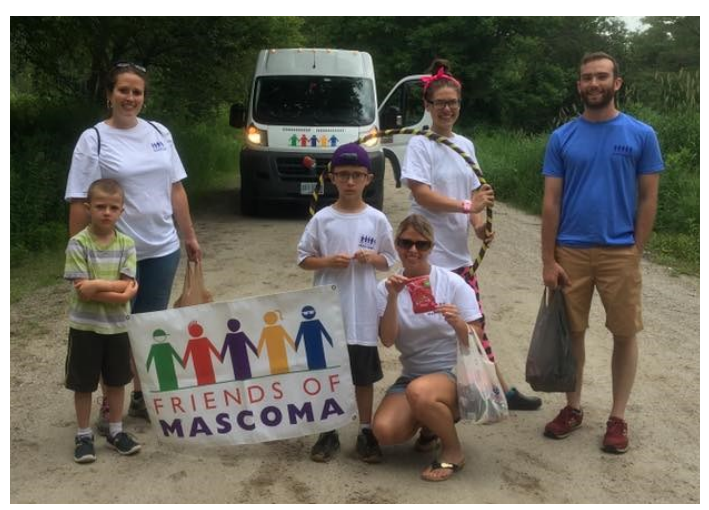
FOM participated in the Canaan and Enfield Old Home Day celebrations, and also the Grafton Independence Day parade (pictured above).