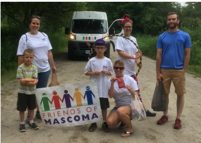
FOM participated in the Canaan and Enfield Old Home Day celebrations, and also the Grafton Independence Day parade (pictured above).