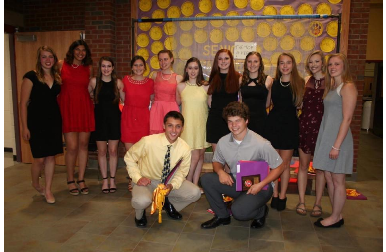
2017's scholarship recipients

FOM awarded 13 scholarships totaling $14,500 to very deserving and ambitious students in the Class of 2017. This was thanks to a successful NH Gives* fundraising campaign, individuals, and companies sponsoring scholarships. In total, FOM has been able to award over $21,000 in scholarships since our scholarship program launched. Below is a list of scholarship recipients from the Class of 2017: