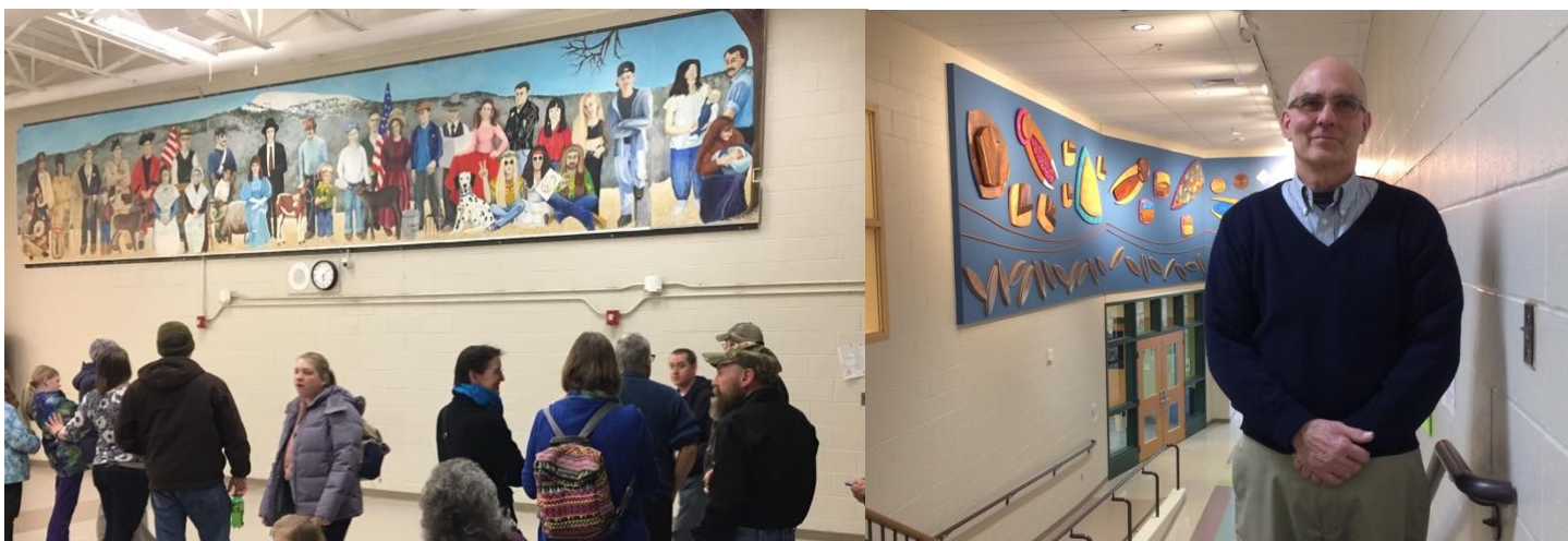
Unveiling of the Generations mural (left) and Diverse Unity (right) - both at MVRHS.

If you have not already seen the restored mural be sure to check it out on your next trip to MVRHS. Thank you to everyone that donated and volunteered their time to make this restoration project a reality.