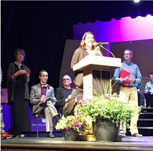
Board members presenting scholarship awards at MVRHS in June.