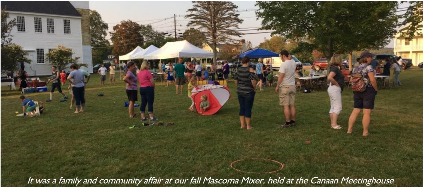
It was a family and community affair at our fall Mascoma Mixer, held at the Canaan Meetinghouse